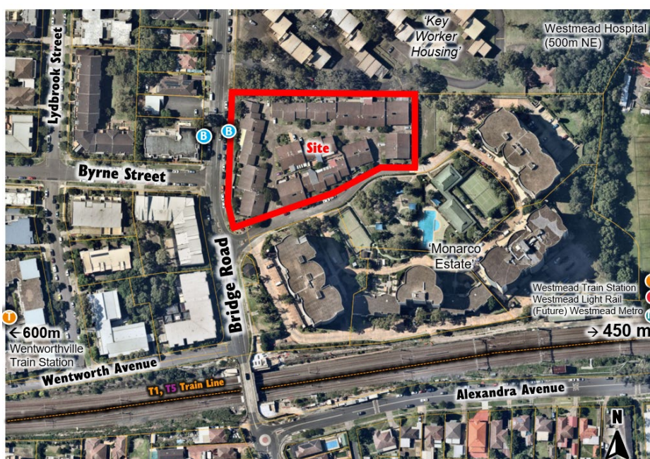
Figure 1 - Subject site

The site is in proximity to various public transport options including Westmead Railway Station, which is adjacent to the recently opened Parramatta Light Rail, and a future Metro Station (2032). The site is also located on the western edge of the Westmead Health and Education Precinct and Innovation District.