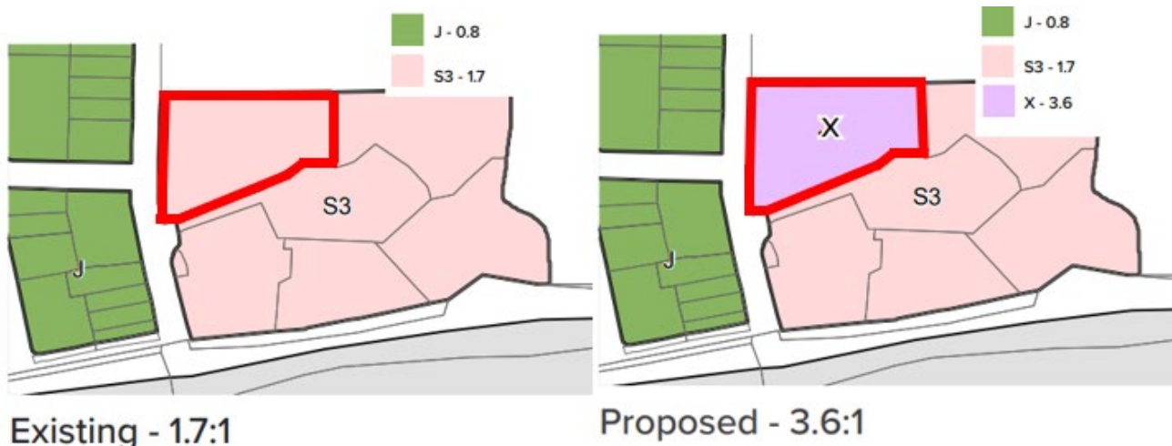
Figure 3 – Existing and proposed Floor Space Ratio (FSR)