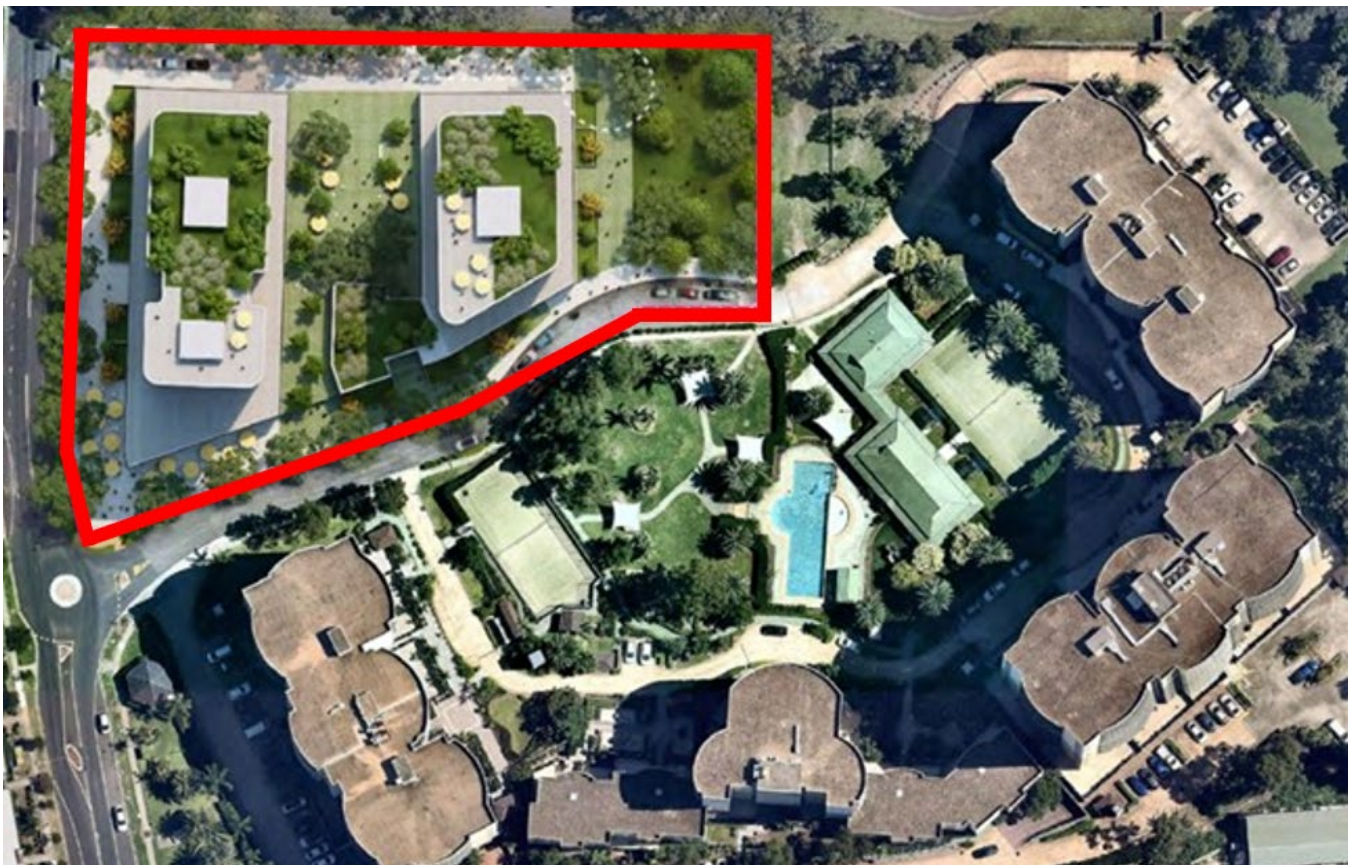
Figure 2 – Proposed concept plan

This proposed development scheme is indicative only and subject to a further development assessment process should the planning proposal be supported. This proposal does not approve any development on the site.